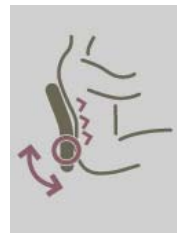
Adjustable Lumbar Support