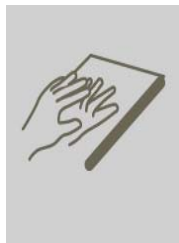
Life-Foam Memory Foam